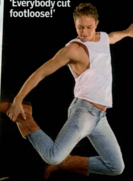
'Everybody cut footloose!'