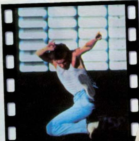
Kevin Bacon played Ren in the classic Eighties dance movie